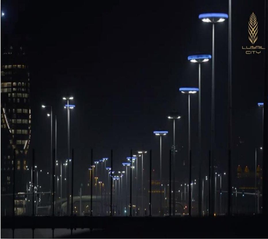
FIRST UFO IN DOHA - LUSAIL