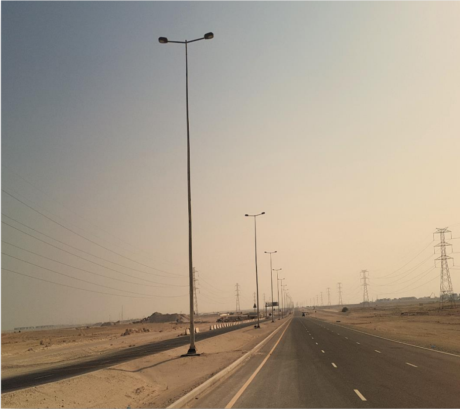
WAKRA CENTRAL MARKET