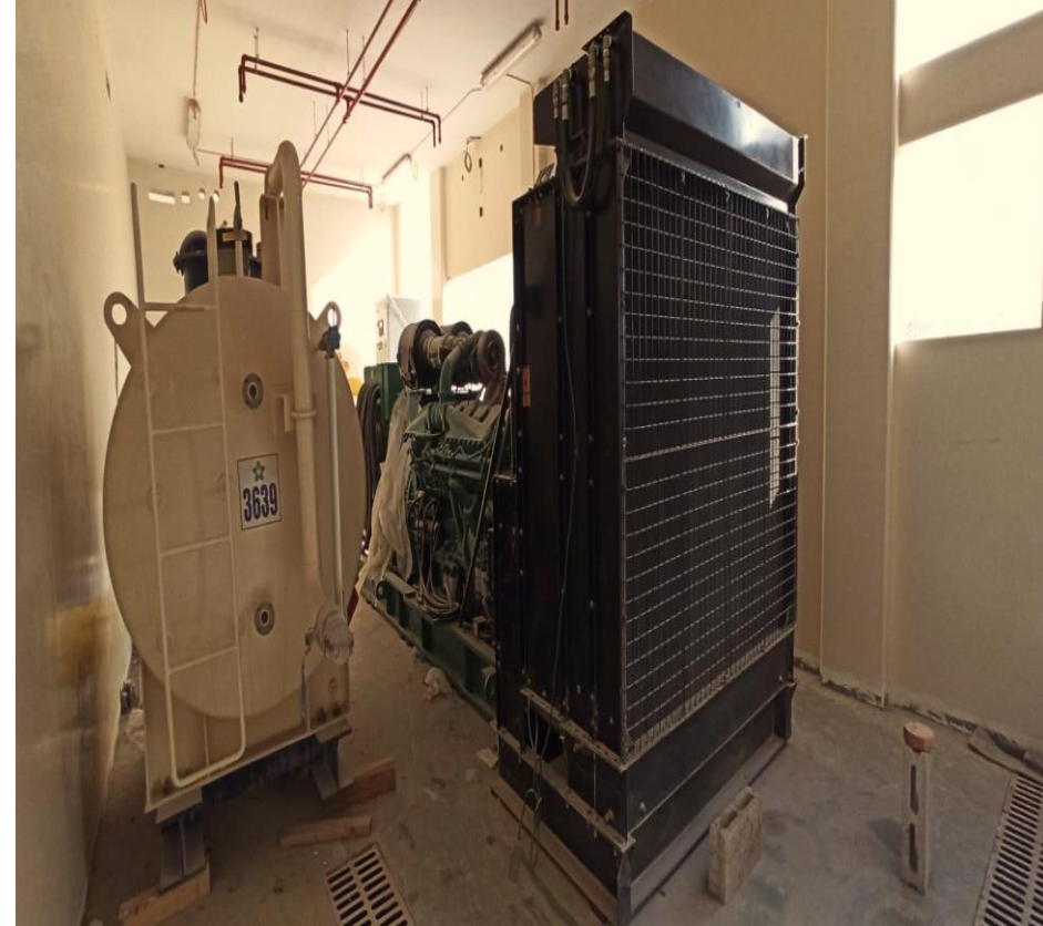
LUSAIL COMMERCIAL BOULEVARD