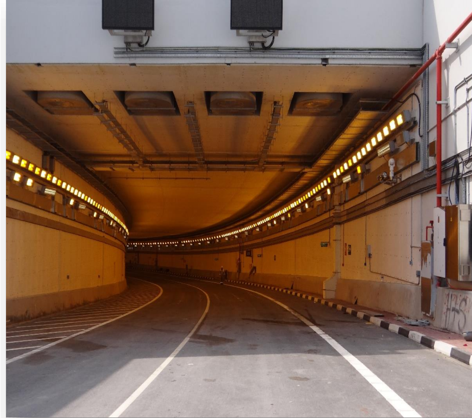
BARWA DIRECTIONAL TUNNEL