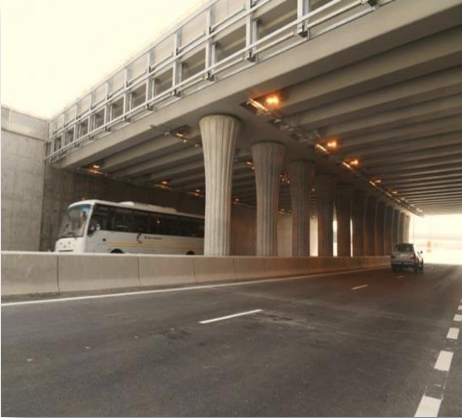
KHALIFA AVENUE AND BANI HAJAR