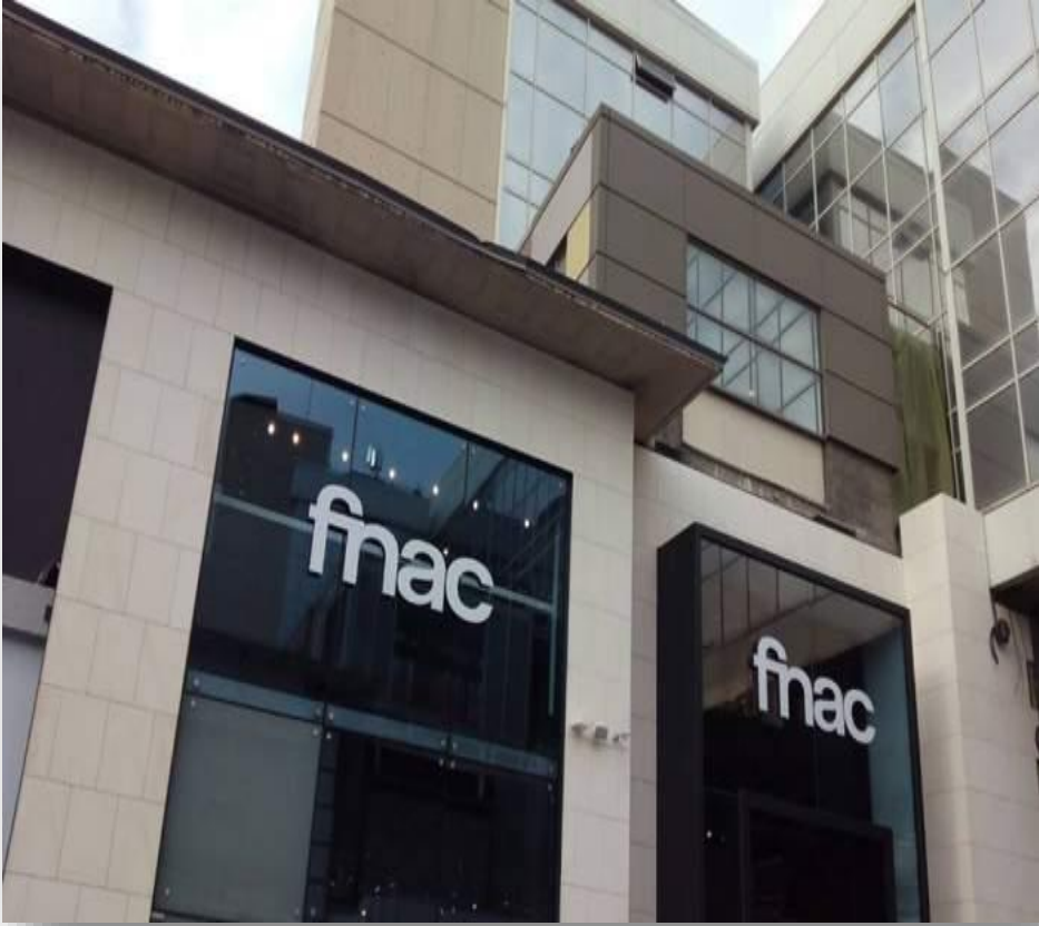
FNAC STORE AT LAGOONA MALL