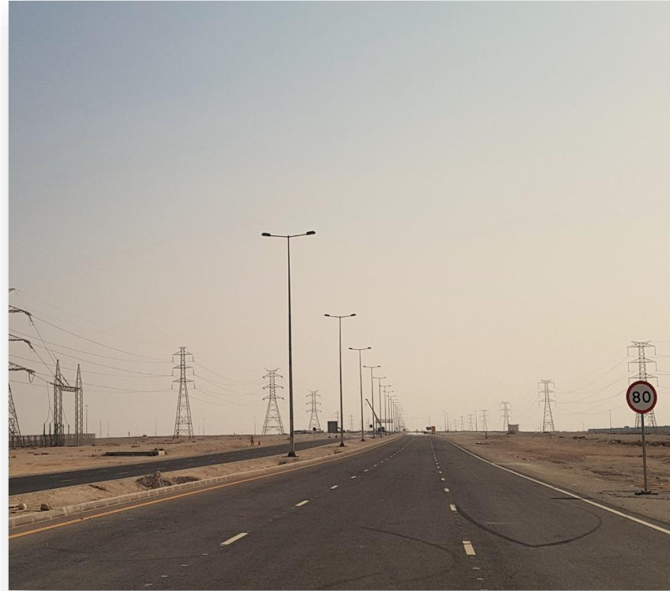
WAKRA CENTRAL MARKET