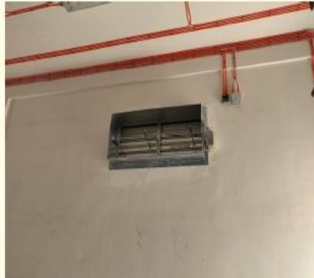
GIARDINO VILLAGE – THE PEARL