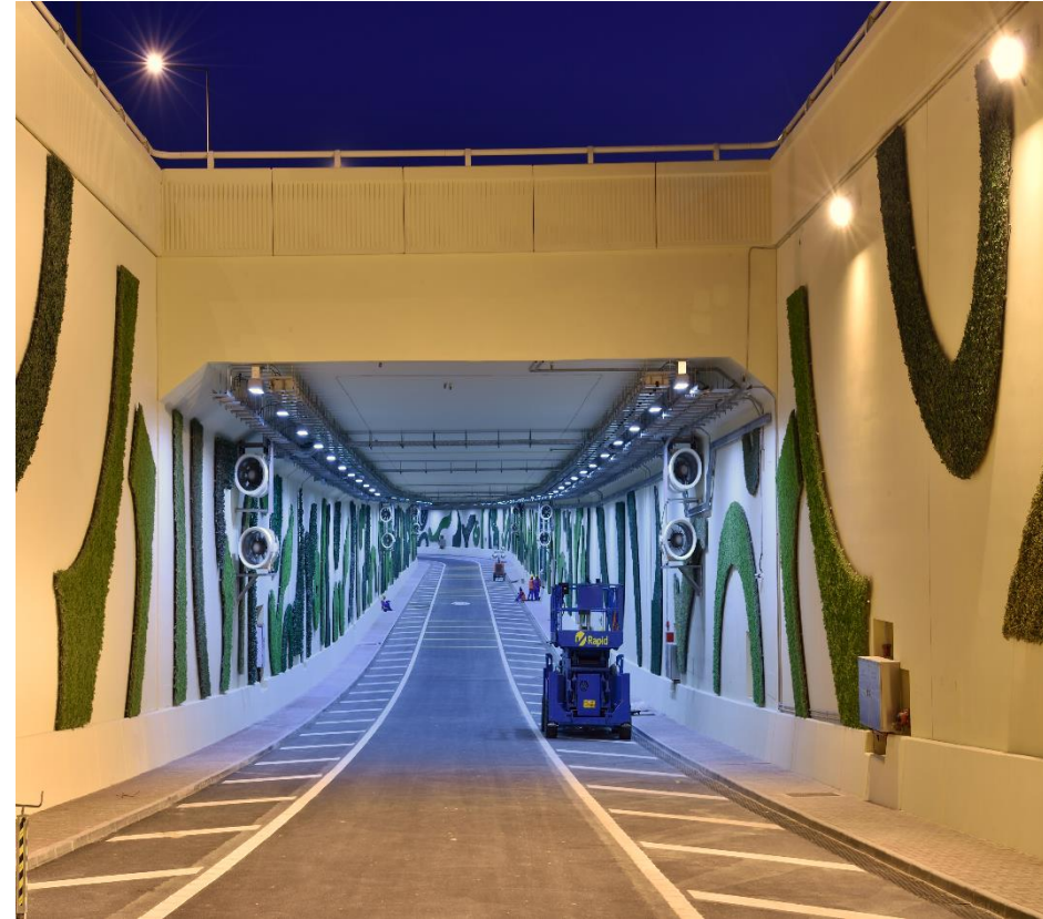
QATAR ACADEMY TUNNEL