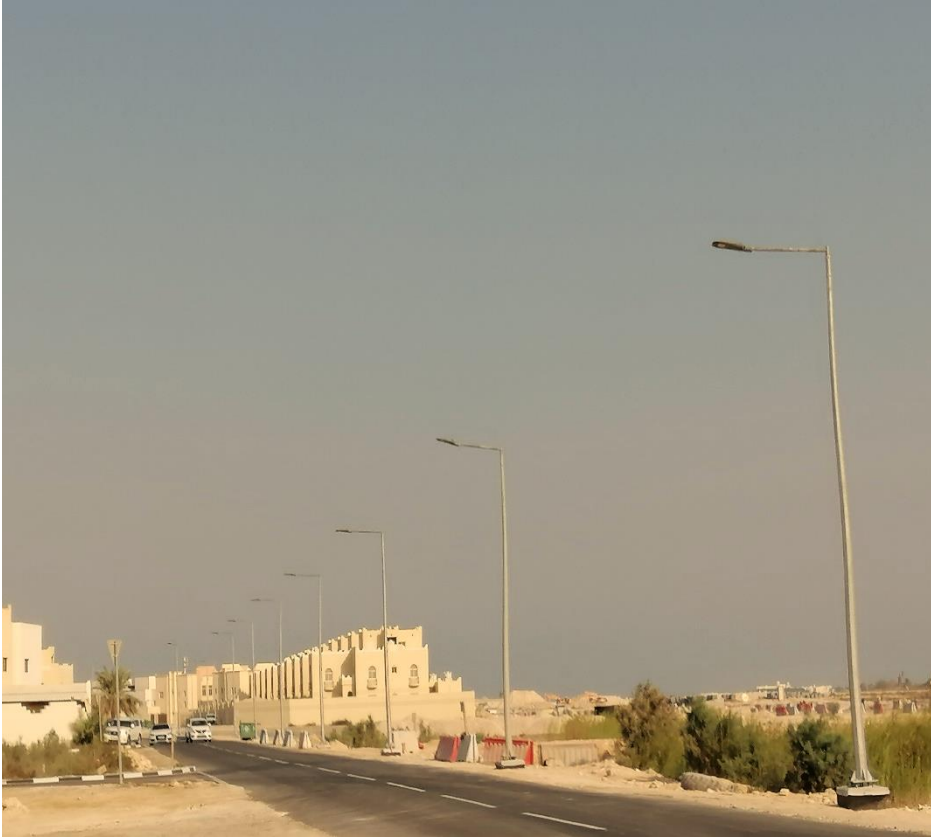
ALKHOR AREA 1 & 2