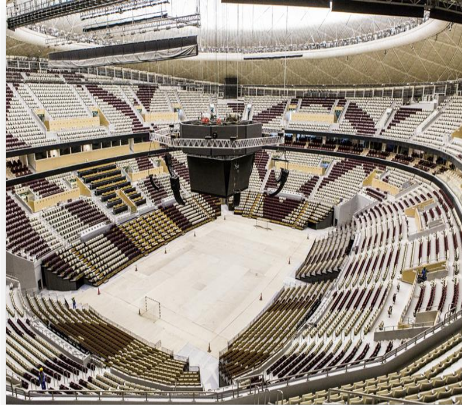
LUSAIL MULTIPURPOSE HALL