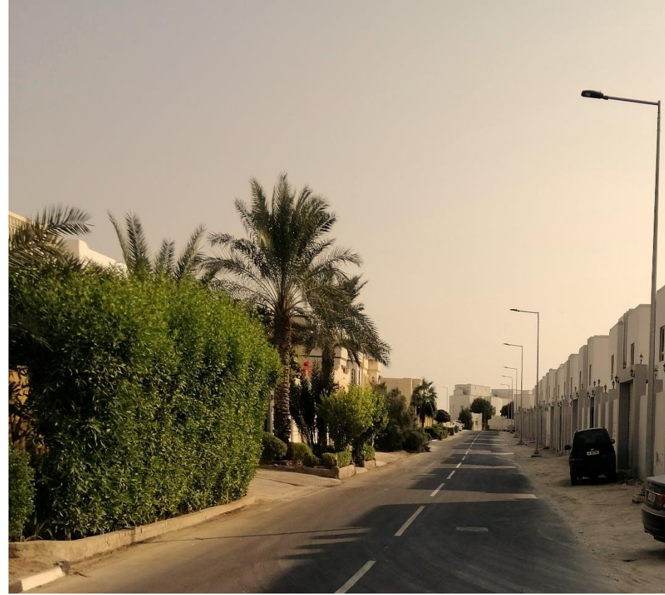
ALKHOR AREA 1 & 2