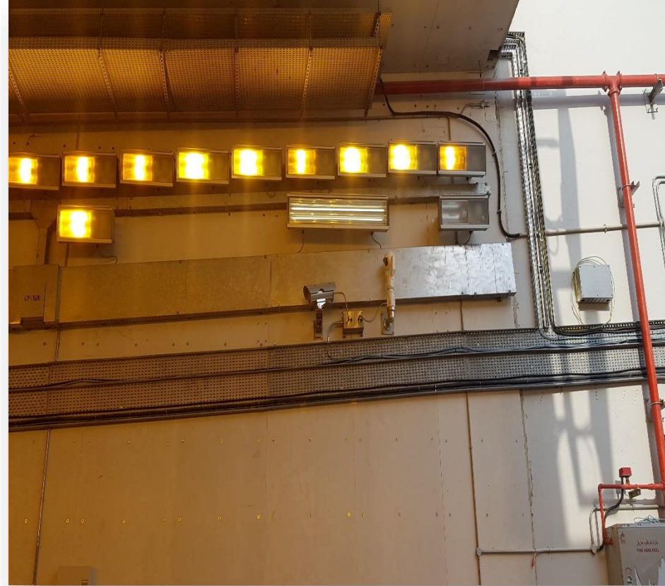
BARWA EDUCATIONAL CITY