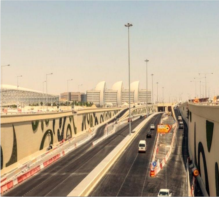
GHARAFRA ROAD(HIGH MAST)