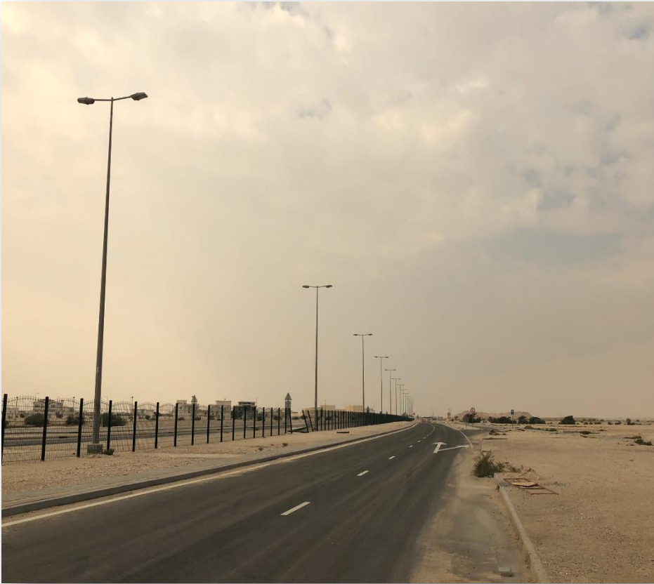
RAWDAT ABAL HEERAN