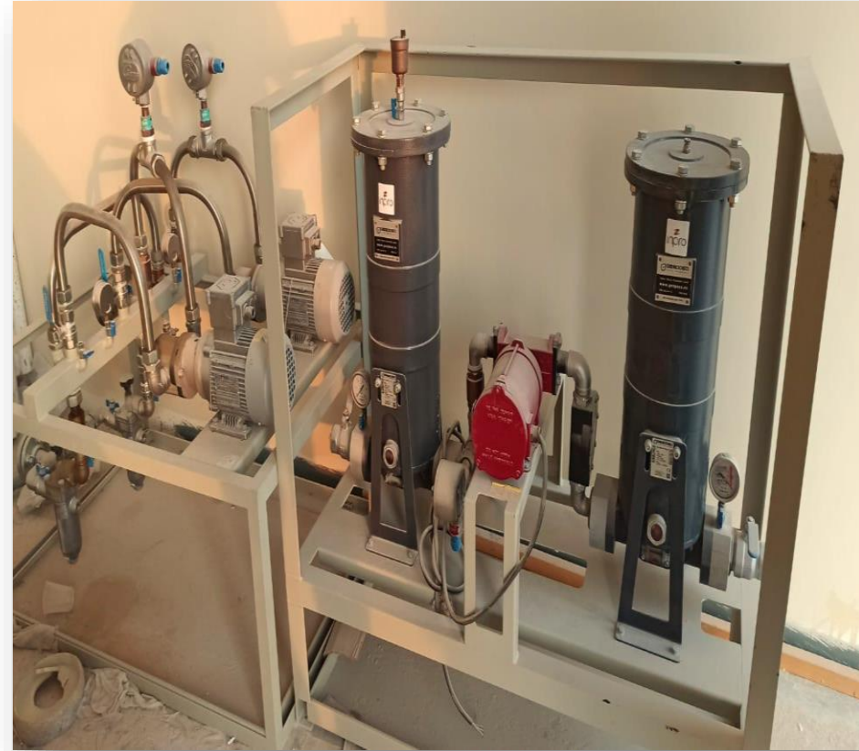
NEW ORBITAL HIGHWAY C2