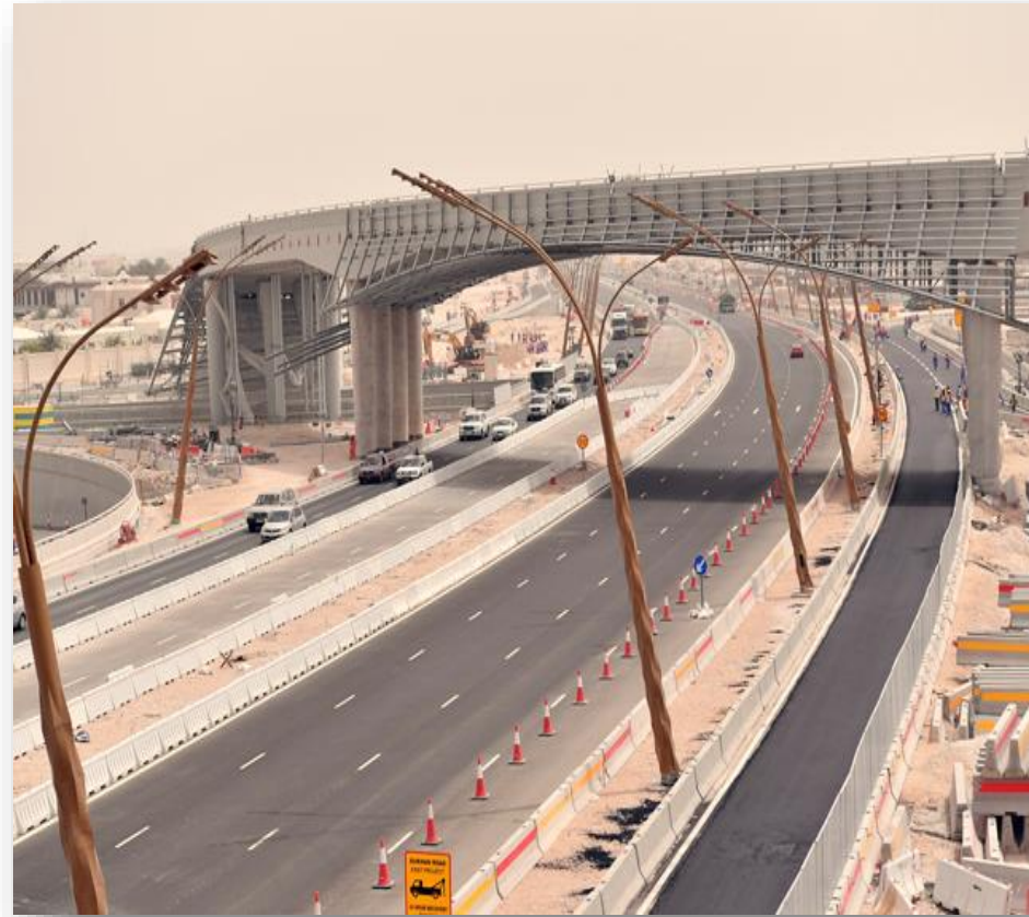
KHALIFA AVENUE AND BANI HAJAR