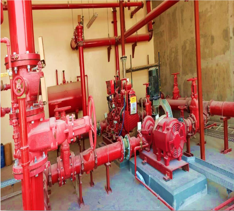
NEW ORBITAL HIGHWAY C2