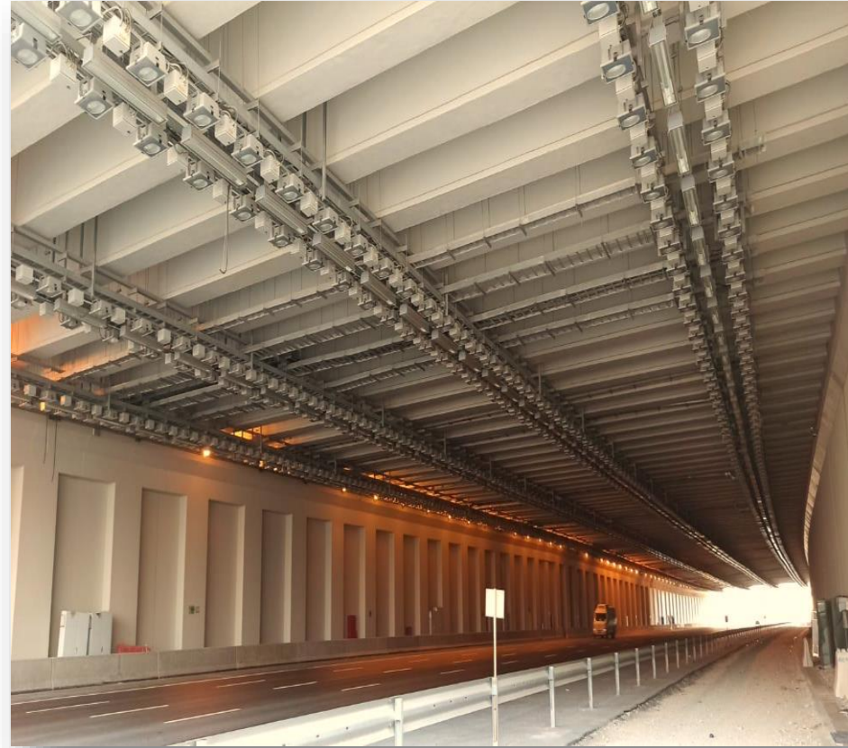
NEW ORBITAL HIGHWAY C2